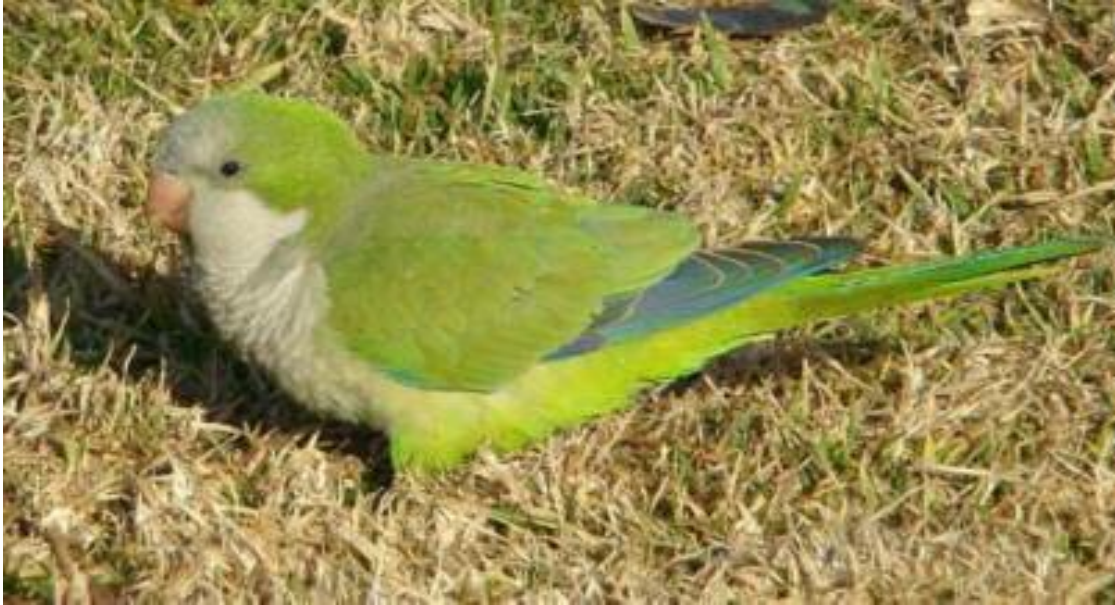
Monk Parakeet Myiopsitta monachus

3 breeding pairs, 40 birds in Herts. (2004)