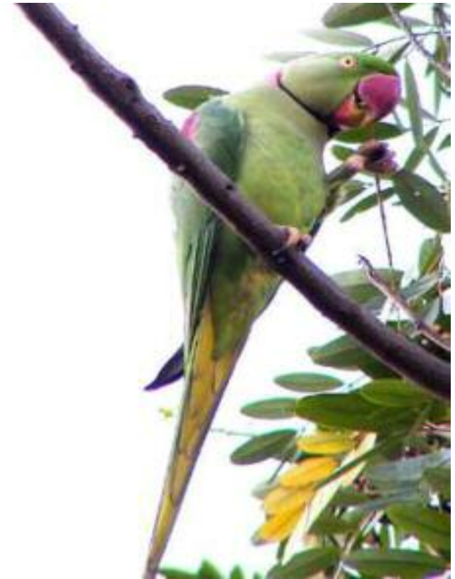
Alexandrine Parakeet Psittacula eupatria