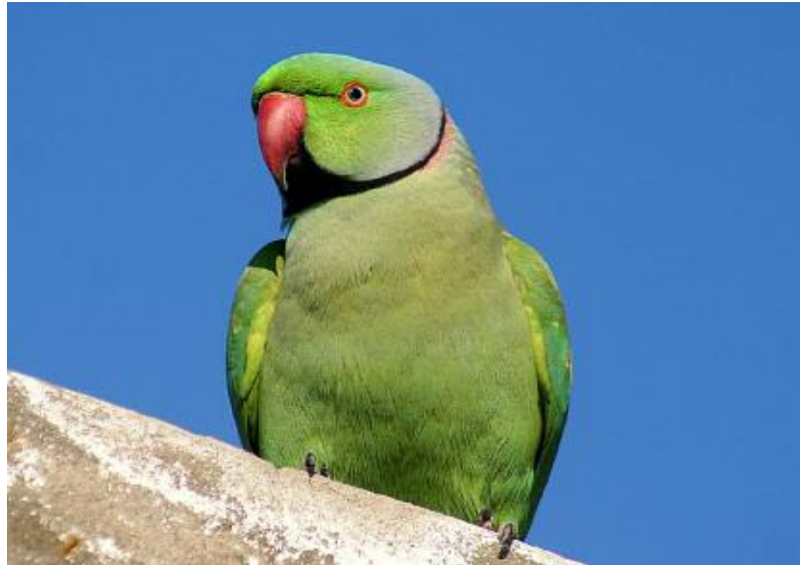
Rose-ringed Parakeet Psittacula krameri